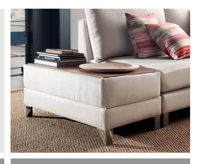
Stylish metal leg design