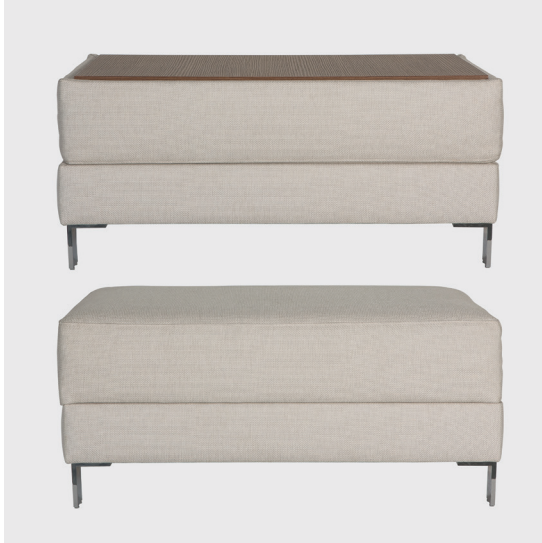
2 different ottoman modules as large ottoman and ottoman with coffee table